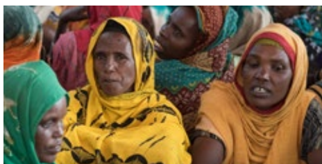
East Hararghe, Ethiopia - discussion with Village Savings and Loan groups and others