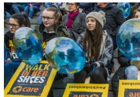
'Walk in Her Shoes' a mother's day march in solidarity with women and girls around the world and in advance of International Women's Day