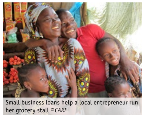
Small business loans help a local entrepreneur run her grocery stall

power, such as governments, traditional leaders and the private sector, to be more responsible, responsive and accountable.