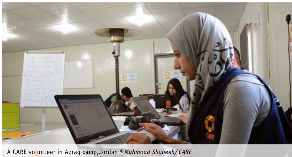
A CARE volunteer in Azraq camp, Jordan

refugees, especially among households headed by women. One third of school-aged children are still out of school, with boys more affected than girls, and many children must work to support their families. Women and adolescent girls continue to be at increased risk of different forms of gender-based violence including child marriage in both public and private spaces.