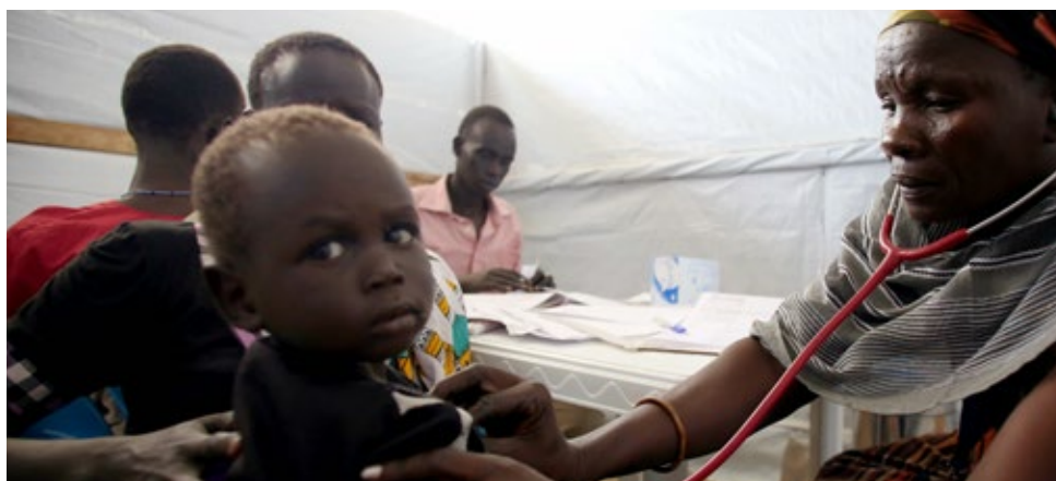
One of two CARE clinics in the Bentiu UN civilian protection area, South Sudan

CARE worked hand-in-hand with local communities, government agencies and civil society partners to help nearly 200,000 people begin their recovery from the disaster, providing emergency shelter, including warm clothes and blankets, seed support, household latrines, and dignity kits.