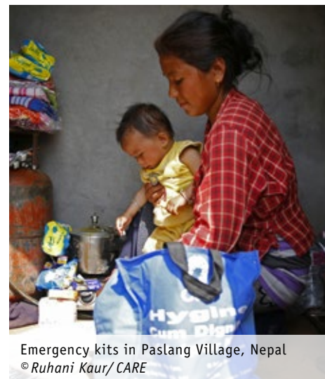
Emergency kits in Paslang Village, Nepal

people in 2015 through its humanitarian response.