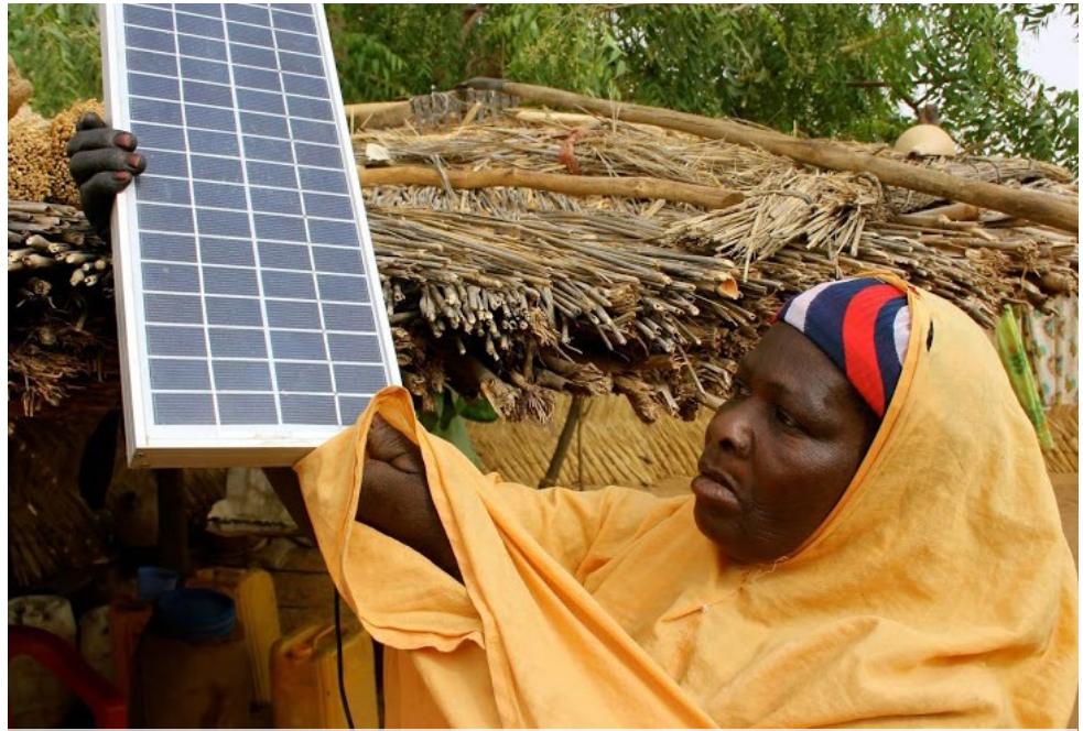
Installing a solar panel, Niger